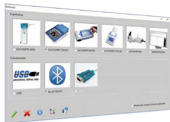
Compatible with all Sibelmed spirometers